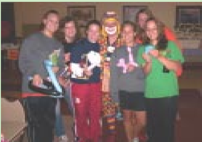
Occupational Therapy students from the University of Findlay have fun with Buttons the Clown at the 2006 Memory Walk